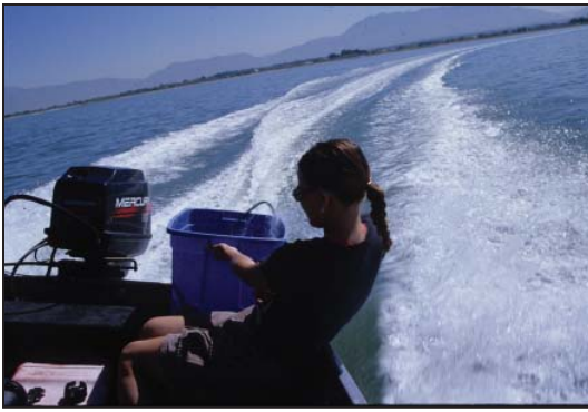
FIGURE 1. Deploying the net.

from the motor and monitored the deployment of the net. As we drove through the grebes, they dove to avoid the boat. We drove the boat in a straight line or in a C-shaped pattern (turning into the side of the boat where the net was trailing) until the net was deployed (Figure 2b). We then headed toward the center of the net for retrieval, which caused any surfaced birds to dive once again (Figure. 2c).