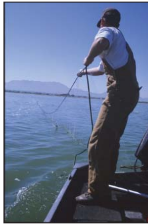
FIGURE 3. Retrieving the net with grebe.

Capture mortality from April 24, 2000, until October 6, 2000, was 4%. From October 7, 2000, until November 30, 2000, we used the modified capture technique where the entire net was pulled from the water (as opposed to earlier trials when just the portion containing a bird was pulled