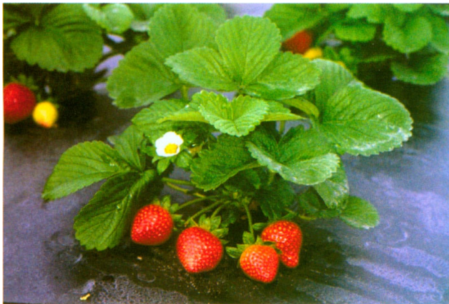
Fig. 2. 'Earlibrite' strawberry.

w Mean separation within columns and seasons by Fisher's protected LSD test, P \leq 0.05 .