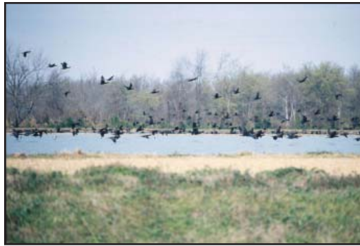
Cormorants over a pond.

Direct comparison of point and precision estimates was a useful tool for comparing survey strategies, but we must acknowledge certain limitations. For example, we did not estimate visibility bias for either sampling