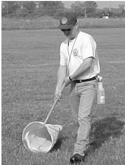
Sweeping a transect for arthropods.

The general recommendation that tall-vegetation management will remove bird problems from an airport is not consistent with our findings. Grassland birds have diverse