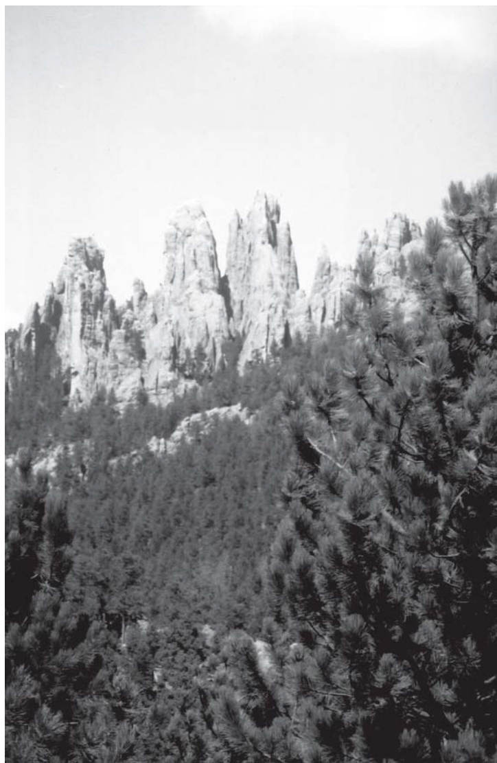
1. "The Needles" in the Black Hills.