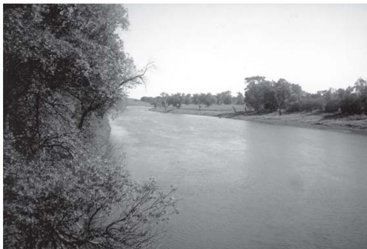
2. The James River Valley, a mixture of grasses and trees.

the Dakotas—contained a mixture of grasses, with groves of cottonwood and elm near the streambeds. The prairie plains also supported a wider variety of wildlife than the high plains: white-tailed deer, elk, bear, and antelope in addition to the buffalo.