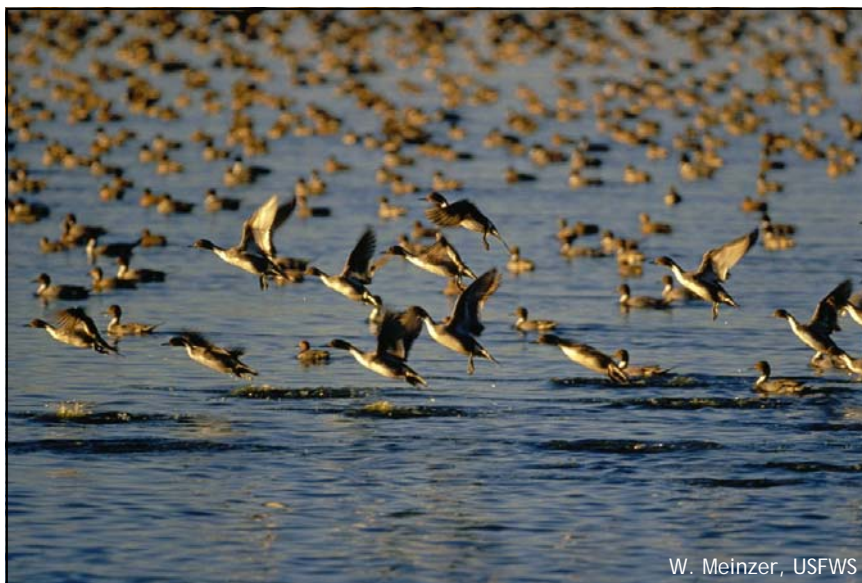
W. Meinzer, USFWS

Waterfowl foraging efficiency declines as resources are depleted. Studies suggest a threshold of 20 kg/acre of dry seed mass at which point waterfowl no longer forage efficiently (Reinecke et al. 1989). The amount of energy waterfowl can derive from 1 gram of seed is described as true metabolizable energy (TME). TME is represented as kcal of energy per gram of forage (kcal/g). This value is central to a bio-energetic model as it allows grams of seed per acre to be represented as energy (kcal) per acre. This conversion allows a bio-energetic model to relate available forage to waterfowl energetic requirements. For example, Kaminski et al. (2003) deter-