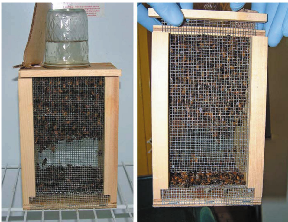
Figure 1. Left: The packages were chilled at 2°C for 20 min to force the bees to cluster. Right: Front view of the package highlighting the sliding screened side used to collect dead adult bees.