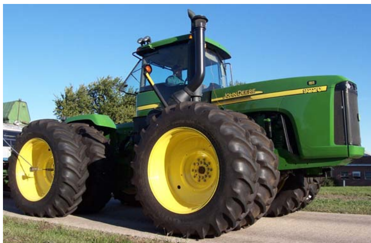
JOHN DEERE 9220 DIESEL