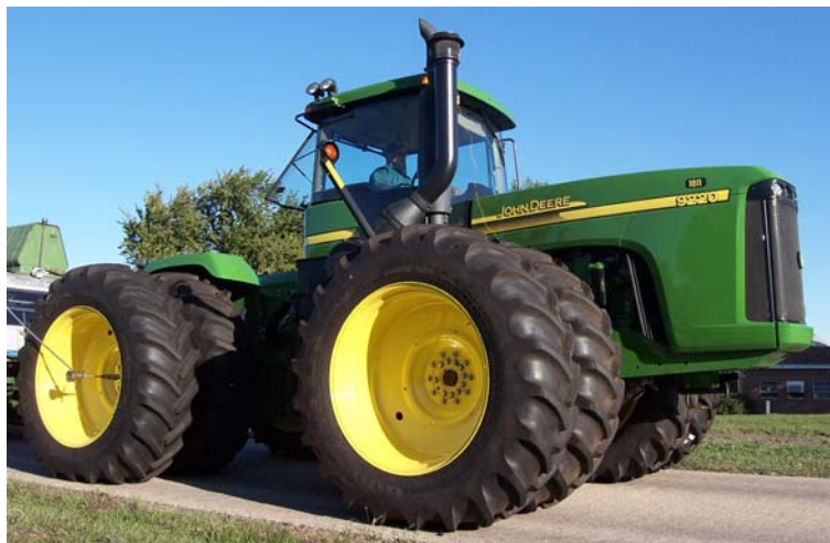
JOHN DEERE 9220 DIESEL