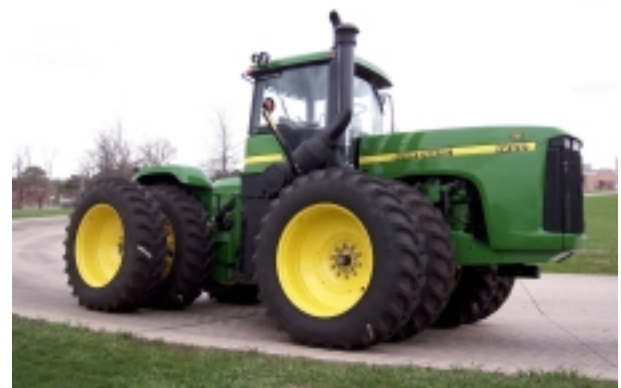
John Deere 9200 Diesel

Clutch wet multiple disc hydraulically actuated by foot pedal Brakes wet multiple disc hydraulically actuated foot pedal Steering hydrostatic and articulated Power take-off 1000 rpm at 1895 engine rpm Unladen tractor mass 32980 lb (14959 kg)