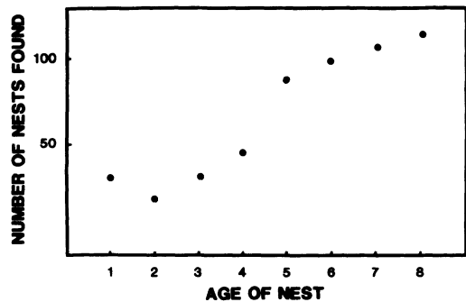
Fig. 2. Number of Blue-winged Teal nests found at specified ages.

Evidence for the level of detectability can come from at least four sources. The first is subjective, based on the general appraisal of the habitat, the size of the nesting area, the hiding potential of the vegetative cover, the intensity of the searches, thoroughness of the investi-