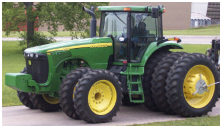
JOHN DEERE 8520 DIESEL