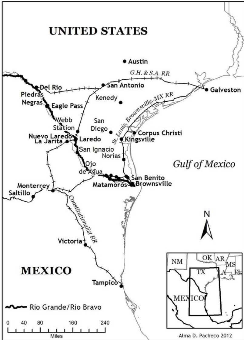
MAP 1. South Texas and northeastern Mexico.