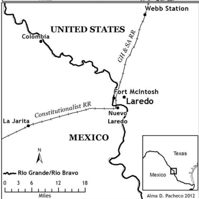
MAP 2. Lower Rio Grande, Texas side ( above ) and Mexican side ( below ). Created by Alma D. Pacheco, 2012.