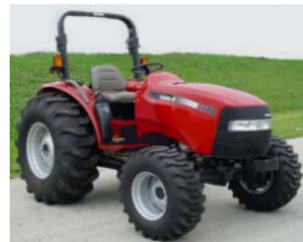
Case IH DX 48 Diesel