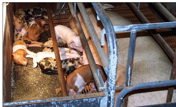
Fig. 1. A litter of offspring derived from a cloned boar.

Eighty-nine gilts were artificially inseminated with shipped boar semen resulting in the farrowing of 61 gilts, as previously described [10]. Many phenotypic differences were observed within the litters (Fig. 1) due to the genetic backgrounds of boars used in the study (terminal cross lines). Within 12–24 h after birth, each live pig was individually weighed, ear notched, needle teeth clipped, injected with 100 mg iron dextran and 300,000 units of