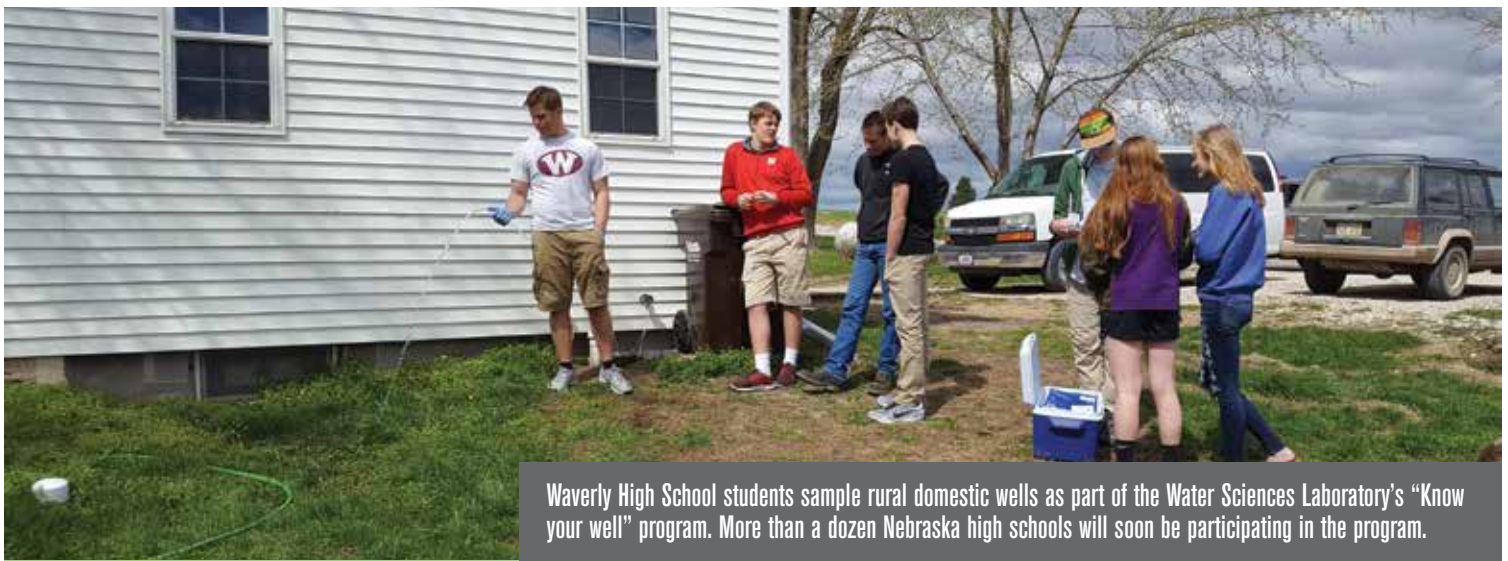
Waverly High School students sample rural domestic wells as part of the Water Sciences Laboratory's "Know your well" program. More than a dozen Nebraska high schools will soon be participating in the program.