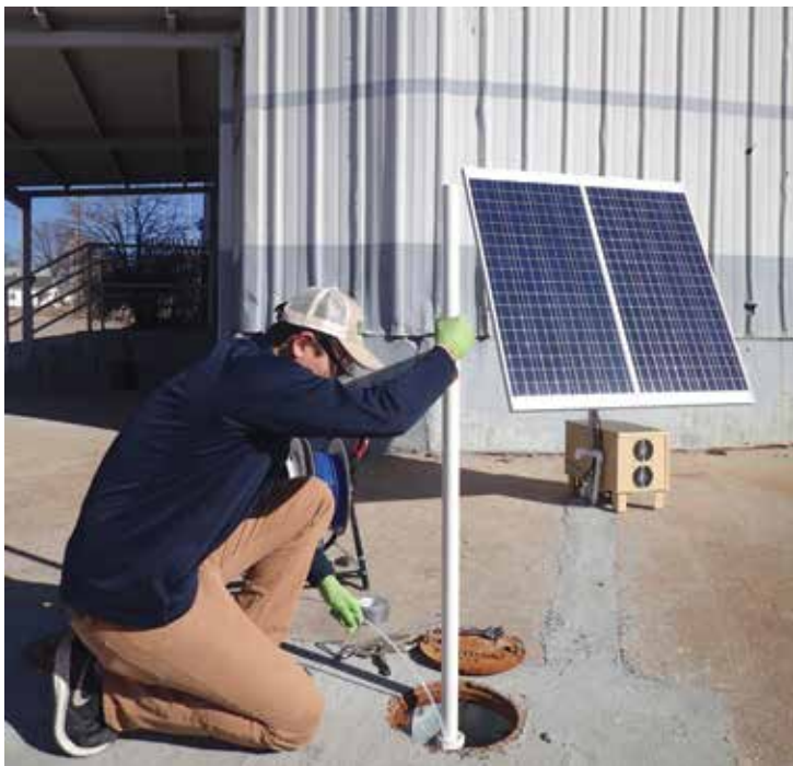
Easy installation of oxidant candles by AirLift Environmental.