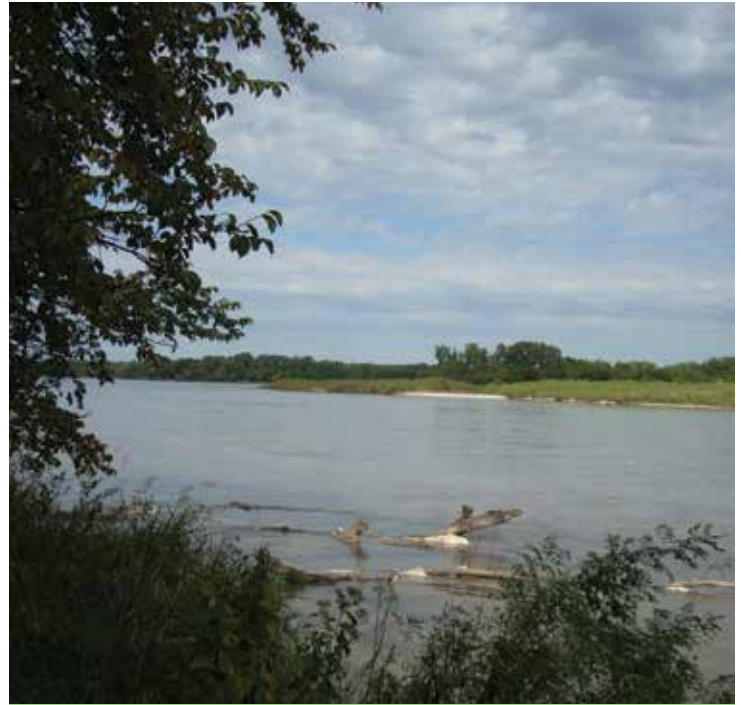
The Platte River in central Nebraska.

"Their scope and emphasis has evolved and broadened since then to encompass many other water, natural resources and environmental-related topics impacting Nebraska," Ress said.