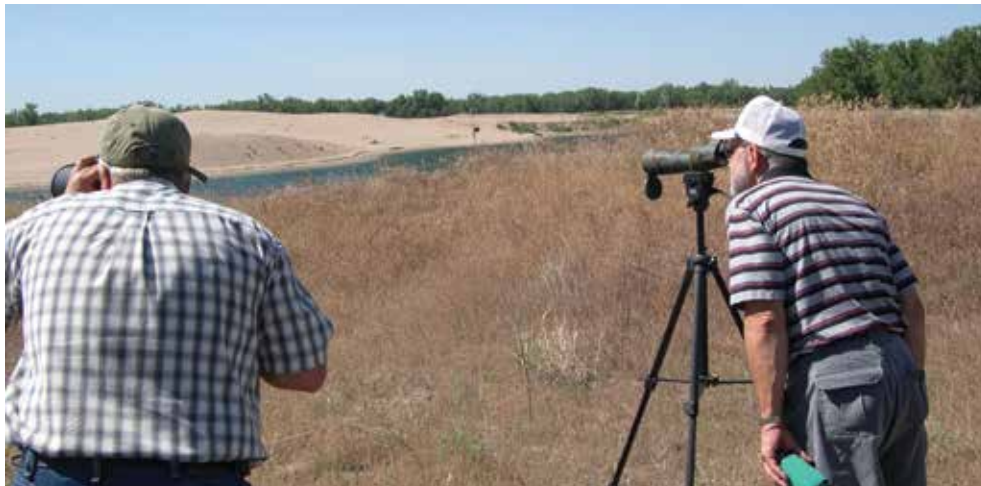
Looking for nesting and endangered species on the Platte River near Lexington.