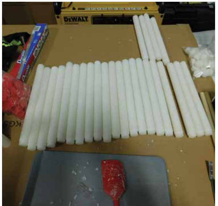
Oxidant candles manufactured by AirLift Environmental in Lincoln.