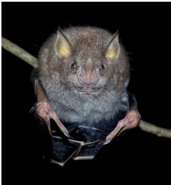
Figure 6. Photograph of a female Ardops nichollsi from the edge of the crater of The Quill on St. Eustatius. Note the large, complex nose-leaf, the white shoulder spot that is visible above the left wing, and the long, grayish pelage characteristic of this species.

Remarks. —Previously, Jones and Schwartz (1967) recognized five subspecies of Ardops nichollsi , where the subspecies montserratensis was comprised of individuals of Ardops nichollsi from Montserrat and St. Eustatius (Fig. 6). Subsequently, this subspecies was reported from Saba (Genoways et al. 2007a), St.