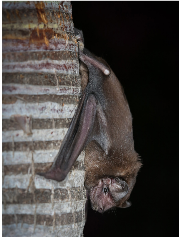
Figure 7. Photograph of Molossus molossus from swimming pool of the Kings Well Resort on the island of St. Eustatius. Note the short, rounded ears, nearly naked face, and chestnut-black coloration characteristic of this species. The tail that is free beyond the edge of the uropotagium, characteristic of all bats of the family Molossidae, is difficult to see between the feet of this individual.

Remarks. —This common “house bat” is widely distributed throughout the archipelago and was expected on St. Eustatius (Fig. 7). Koopman (1968) first reported specimens of this species from St. Eustatius without reference to specific specimens or localities. Husson (1962) restricted the type locality of M. molossus to the island of Martinique, which led Dolan (1989) based on morphometrics to apply the name M. m. molossus to this species throughout the Lesser Antilles. Lindsey and Ammerman (2016) included specimens