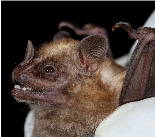
Figure 5. Photograph of a male Artibeus jamaicensis from swimming pool of the Kings Well Resort on the island of St. Eustatius. Note the large nose-leaf, white stripe over the eye, and brown coloration, all characteristic of this species.

Hispaniola, Puerto Rico, St. John, and Dominica (Genoways et al. 2001). P. Larsen et al. (2007) included 10 individuals of A. jamaicensis collected from St. Eustatius in their phylogenetic analysis of the Artibeus jamaicensis complex. Their results show a single mitochondrial cytochrome- b haplotype shared among the 10 individuals and this haplotype was also shared with individuals collected from a wide geographical distribution, ranging from Quintana Roo, Mexico, eastward to Jamaica and Puerto Rico, throughout the northern Lesser Antilles, and as far south as Carriacou in the Grenadines. The results of P. Larsen et al. (2007) support the hypothesis of a recent Caribbean colonization by A. jamaicensis (perhaps within the last ~25,000 years) originating from Central American populations and expanded rapidly to the east across the Greater Antilles and Lesser Antilles. Carstens et al. (2004) identified a similar lack of genetic variation across the northern Lesser Antilles; however, their analyses also identified three A. schwartzi mitochondrial haplotypes on the islands of Montserrat, Nevis, and St. Kitts (see P. Larsen et al. 2007 and P. Larsen et al. 2010). The existence of A. schwartzi mitochondrial haplotypes circulating in northern Lesser Antillean populations of A. jamaicensis provides evidence of historical or ongoing hybridization (P. Larsen et al. 2010). Moreover, this observation suggests gene-flow from southern