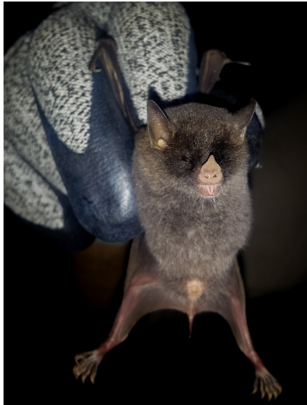
Figure 3. Photograph of a female Monophyllus plethodon , which was the first individual of this species captured on St. Eustatius. This bat was taken at the edge of the crater of The Quill. Note the elongated rostrum, simple nose-leaf, and presences of a tail characteristic of this species.

On this evening the Dutch Team set a 3-m net at a height of 5 m in the middle of the hiking trail from Yellow Rock where it comes near to the edge of the crater of The Quill, and a 7-m net was placed at a right angle to the 3-m net along the rim of the crater. These nets were undoubtedly set near where the American Team