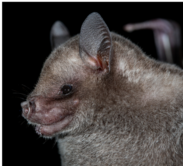
Figure 4. Photograph of a female Brachyphylla cavernarum taken from a mango tree near the F. D. Roosevelt Airport on the island of St. Eustatius. Note the greatly reduced nose-leaf and gray coloration characteristic of this species.

Martinique confirming the placement of St. Eustatius individuals in the nominate subspecies. Individuals from St. Eustatius and Barbuda averaged among the largest in measurements for the subspecies. Carstens et al. (2004) examined the genetic structure of northern Lesser Antillean populations of B. cavernarum , and they included two individuals collected from St. Eustatius in their analyses. Their results showed low genetic diversity (within the mitochondrial cytochrome- b gene) across the islands of St. Maarten, St. Eustatius, Saba, Nevis, and Montserrat. The two individuals examined from St. Eustatius differed by a single nucleotide in cyt-b sequences and these haplotypes were identified on neighboring islands (Carstens et al. 2004). Despite the lack of genetic structure observed in cyt-b gene variation, we recommend additional genetic analyses, perhaps using advanced genetic approaches appropriate for population-level genetic resolution (for example, high-throughput Restriction site Associated DNA Sequencing; RAD-seq), of Caribbean populations of B. cavernarum .