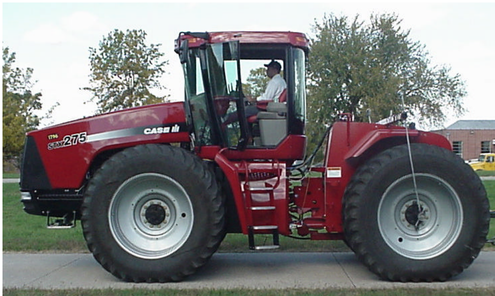
Case IH STX 275 Diesel