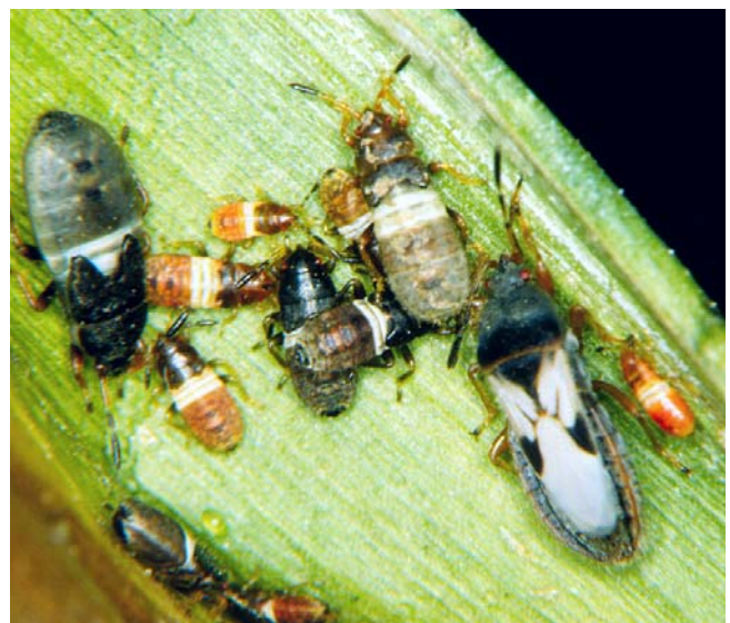
The common chinch bug is widely distributed across the east coast and western plains of the United States and south in Mexico.

In the U.S. there are four chinch bug species that are of major economic importance: the common chinch bug, Blissus leucopterus leucopterus , the southern chinch bug, Blissus insularis , the hairy chinch bug, Blissus leucopterus , and the western chinch bug, Blissus occiduus (8). Chinch bugs are widely distributed throughout the United States, primarily east of the Rocky Mountains. Individual species often have overlapping geographic distributions. In particular, the geographic distribution of the western chinch bug, and its preferred host, buffalograss, are such that any of the other chinch bug species could be