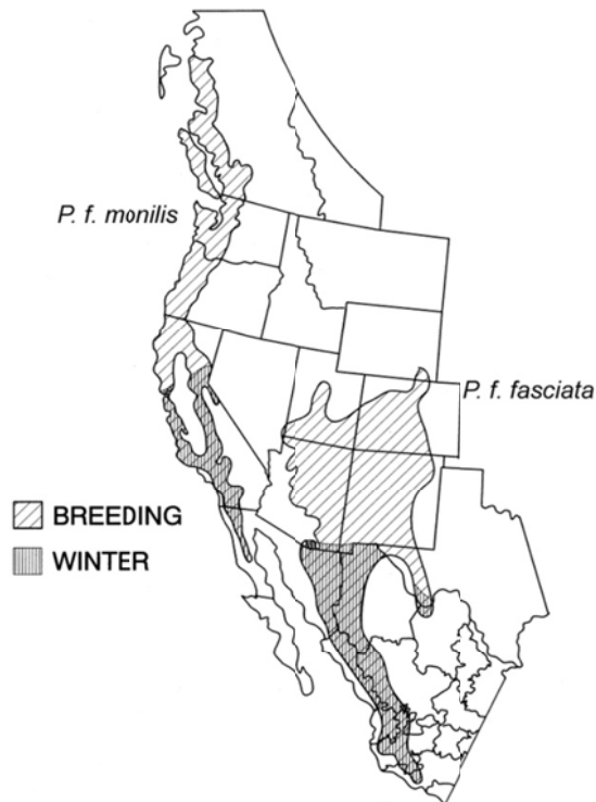
Figure 1. Distribution of Pacific Coast ( P. f. monilis ) and Interior ( P. f. fasciata ) band-tailed pigeons in North America (after Braun et al. 1975).

Little is known about the demographics of band-tailed pigeon populations because their habits and habitat make it impractical to locate and observe or trap an adequate sample of birds. However, in the early 1970s the total population size was approximated at 2.9–7.1 million birds in the Pacific Coast region and <250,000 birds in the Interior region (estimated from harvest reports and band recovery rates, Braun 1994). This demonstrates the likely sizes and disparity between the two populations at that time.