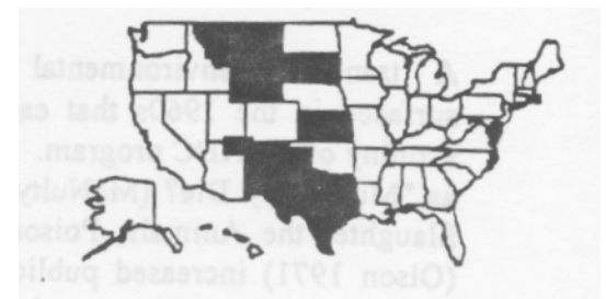
Registration to M-44 use other than APHIS 3-ADC

States and entities other than APHIS-AD also use the M-44 in control program (Fig. 2). These groups purchase M-4 capsules and equipment from APHIS-ADC