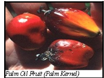
Palm Oil Fruit (Palm Kernel)

Oil palm ( Elaeis guineensis ) is a perennial crop that originated in West Africa, probably in Sierra Leone and Guinea. The crop spread to other parts of Africa and then to Asia, notably Malaysia and Indonesia. Today, Malaysia and Indonesia are the leading producers and exporters of oil palm products. In 2007, Malaysia exported almost 14 million metric tons of palm oil, while Indonesia exported about 13 million metric tons in the same year. 1