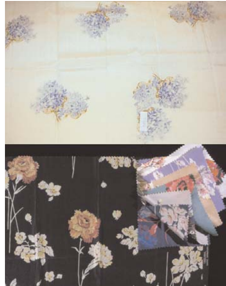
Fig.7 H.R. Mallinson & Co. Textile lengths, "Rhode Island Violets," 1915 (above) and "Indiana Carnation," 1929 (below).

by the fifteen-design American Indian series. [fig.9] The company borrowed Native American artworks from the Brooklyn Museum to decorate the showroom for this opening, and this line too sold well. Then for Spring 1929 came the Early American series, for which the showroom was transformed into a Mississippi showboat. Music from Jerome Kern's Showboat filled the room, and upwards of two thousand people—buyers, manufacturers and fashion writers—attended. They saw another wide assortment of colors and styles, as within each series Mallinson provided designs ranging from avant-garde to conservative. [fig.10]