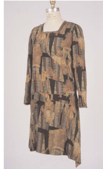
Fig.9 H.R. Mallinson & Co. American Indian series. Dress, "Blackfoot Sun Dance" design. 2001.70.1