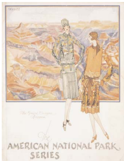
Fig.8 H.R. Mallinson & Co. Blue Book of Silks de Luxe , Spring/Summer 1927. National Parks Series, Front cover. Private Collection.

American themes were perennially popular. State Flower designs were produced in 1915 and again in 1929. [fig.7] American Indian motifs were used in 1916, based on material in New York's American Museum of Natural History, and again for border designs in Fall 1925. 25 For Spring 1927, Mallinson gambled on its American National Parks series. This suite of twelve landscape designs, each available in from eight to twelve colorways on three different fabrications, surpassed in sales and critical response anything Mallinson had ever done, confounding those within the industry who thought the prints too big and too unusual to be fashionable. 26 [fig.8] It was followed by six designs for Wonder Caves of America for Fall 1927,