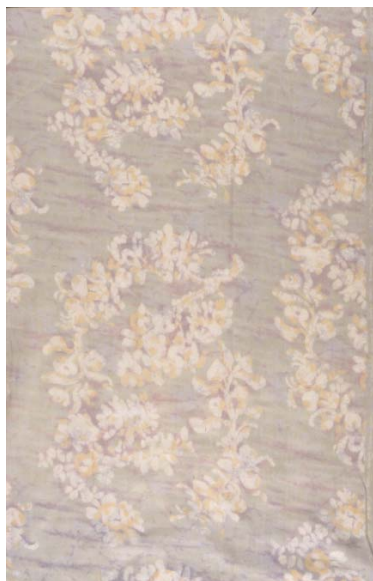
Fig.3 H.R. Mallinson & Co. Textile length, “Tiger Rose.” 1920.

The firm pioneered the use of stage and motion-picture performers in advertisements. The 1914 Mexixe booklet, for example, had photos of Irene Castle and Anna Pavlova in the center spread. “Tiger Rose,” a batik-style print, was designed for and named after a Broadway show in 1918, while a new crepe fabrication in 1921 was dubbed “Molly-O” after a hit film of the same name. 11 [fig.3] In the teens the company offered price breaks to producers who would use Mallinson fabrics to dress their shows, in exchange for permission to use photographs of the performers in publicity. By about 1920, association with the company was so valuable that actresses began to demand that their clothes be made from Mallinson goods. At that point the price breaks stopped. 12