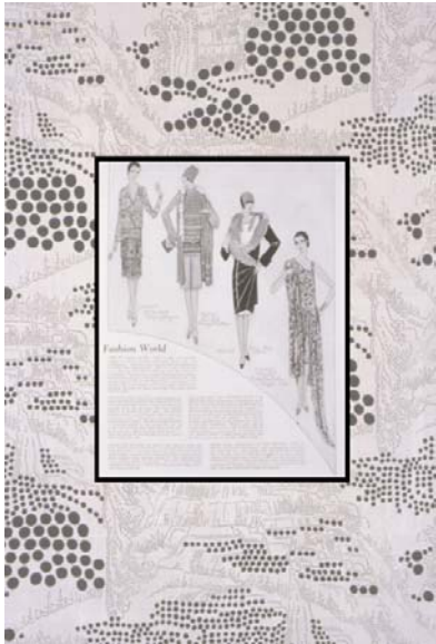
Fig.5 H.R. Mallinson & Co. Blue Book of Silks de Luxe , Spring/Summer 1927. “On Top of the Fashion World.” Illustrations of models by noted European and American designers, including Madeleine Vionnet (top left). Background: “Polka Dots Geographique.” Both, Private Collection.

Mallinson installed the elephant as a permanent fixture in a window of his newly opened Fifth Avenue showroom—except when it became a roving ambassador, as in the 1923 Mallinson float in the New York Fashion Revue parade. Small-scale versions of the sculpture were sent around the country for use in retail window displays. The elephant became an instantly recognizable Mallinson symbol and continued to be used until the end of the company’s life. 18