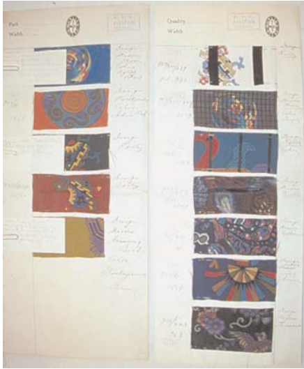
Fig.1 M.C. Migel & Co. Mexixe sample card. 1914.

in the news due to the American war against Pancho Villa. The designs were based on Aztec, Mexican, and American Indian art, and although they were certainly influenced by European aesthetics, the underlying theme was an American original, not a variation on a French idea. The printing, in multiple colors on saturated grounds, challenged European supremacy in that art. The fabrics were used by several Paris couturiers, endorsing this upstart American attempt at original design. 5 It was a stunning critical and sales success for the company and a notable first for the American industry. In its wake, Mallinson changed the company's name to his own in January 1915.