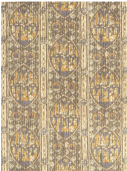
Fig.6 H.R. Mallinson & Co. Textile length, “Sainte Chapelle le Troisieme.” 2001.156

Mallinson fabrics often reflected current events or referenced prominent personalities. Customers might choose solid-color fabrics in such shades as “Brighteyes Blue,” named for Princess Mary of Britain at the time of her wedding in 1922, and “Temple Orange,” inspired by the new fruit in 1921. After the success of the Mexixe prints, feature print series were introduced every season, in addition to the dozens of single designs and solid colors that probably formed the bulk of sales. Current events figured prominently in 1919’s La Victoire prints, introduced a month before the armistice. They included a wartime charm motif from Alsace-Lorraine with the promise that “A Royalty of 5 cents on every yard will be donated to the Fund for the Orphans of Alsace-Lorraine.” 23 In