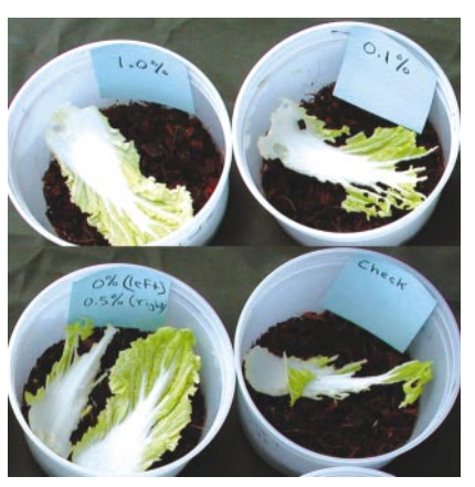
Figure 1 Repulsion of slugs ( Veronicella cubensis (Pfeiffer)) by caffeine-sprayed leaves. Results pictured (clockwise, from top left) are for no-choice treatments using 1.0, 0.1 and 0% caffeine, and for a choice test with 0 (left leaf) and 0.5% caffeine. Caffeine treatment causes slugs to avoid the leafy parts of the cabbage.

To test the effect of caffeine on snails, we treated mature orchid snails ( Zonitoides arboreus (Say); about 3 mm in diameter) topically with caffeine solutions in Petri dishes and examined them under a dissecting microscope to determine their heart rates. One hour after treatment, the heart rates of snails exposed to 0.01% caffeine were raised, whereas those of snails treated with 0.1, 0.5 or 2% caffeine were reduced (Fig. 2a). After 24 h, heart contractions