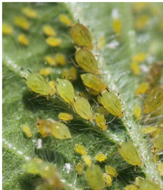
Figure 1. Soybean aphid colony on soybean.

The soybean aphid, Aphis glycines Matsumura (Fig. 1), was first detected in the United States in 2000. Prior to the invasion by this pest, insecticide applications to soybean, Glycine max (L.) Merrill, in the north-central United States were rare (USDANASS 1999), but during the last region-wide outbreak in 2005, millions of acres were treated for soybean aphid (USDA-NASS 2005). Although outbreaks are less common in some states since the mid-2000s (Bahlai et al. 2015), soybean aphid is still the key insect pest of soybean in this region (Hurley and Mitchell 2014). In North America, a tremendous amount of research and observational data have been generated on soybean aphid since its initial detection, and tools and knowledge now exist for effective management of this pest (Hodgson et al. 2012; Ragsdale et al. 2004; Ragsdale et al. 2011; Tilmon et al. 2011).