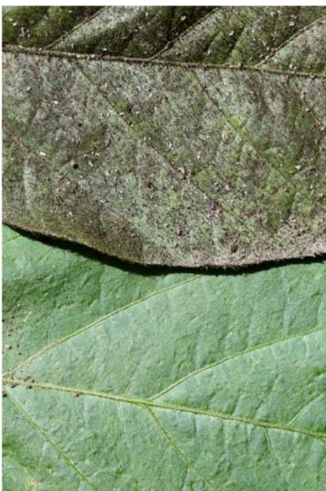
Figure 2. A clean soybean leaf (bottom) compared to a leaf from an aphid-infested plant (top) which is covered with honeydew and sooty mold.

All aphids, including soybean aphid, feed on plant fluids by inserting piercing-sucking mouthparts directly into the phloem and removing water and nutrients (Pettersson et al. 2007), which can decrease photosynthetic rates of soybean (Macedo et al. 2003). To survive and reproduce, soybean aphids require specific nitrogen-rich amino acids that are present in plant fluids at low concentrations (Douglas and van Emden 2007; Mittler and Douglas 2003; Walter and DiFonzo 2007), which means they must ingest large quantities of plant fluids to fulfill their nutritional needs (Douglas and van Emden 2007). Nutrient (Myers et al. 2005; Myers and Gratton 2006; Walter and DiFonzo 2007) and moisture (Nachappa et al. 2016) status of soybean influences the composition of the plant fluids and, in turn, soybean aphid. In addition, quality of plant fluids likely influences location of soybean aphids within the canopy as plants age (McCornack et al. 2008). Excess water and sugars from the plant fluids are excreted by aphids as sticky waste (Malumphy 1997) called “honeydew,” which accumulates on leaves of heavily infested plants. Sooty mold fungus (Fig. 2) can grow on honeydew-covered leaves, blocking sunlight and further interfering with photosynthesis (Malumphy 1997; Lemos Filho and Paiva 2006).