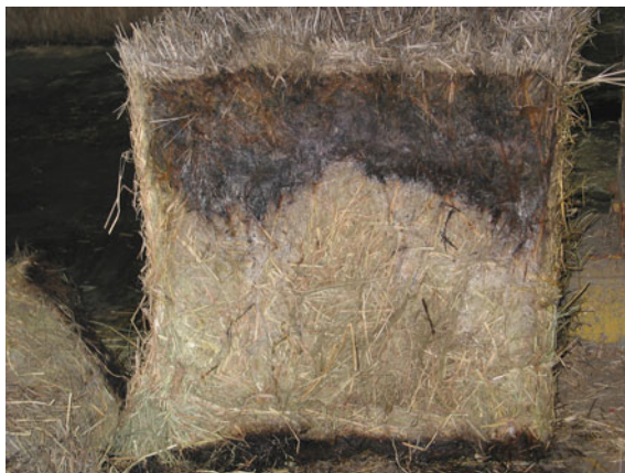
Fig. 5.2 Large rectangular bales are susceptible to spoiling on the top and bottom of the bale if not stored properly. This bale was cut in half to expose the spoilage on the bale interior

have compositional changes during storage. Biomass degradation from weather and microbial activity can be as high as 42% by volume for a round bale [65]. For large rectangular bales, moisture can penetrate at the top of the bale or can be absorbed at the bottom of the bale. A large rectangular bale is comprised of a number of layers of switchgrass compressed together. Water channeling can occur within these layers causing heterogeneous spoilage ([38]; Fig. 5.2).