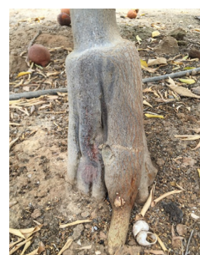
Figure 2: Sample canker symptoms on many trees: (i) showing wide lesions and canker at the crown and the grafted region (on the left) and (ii) advancing dead areas through the cross section of a tree (on the right).