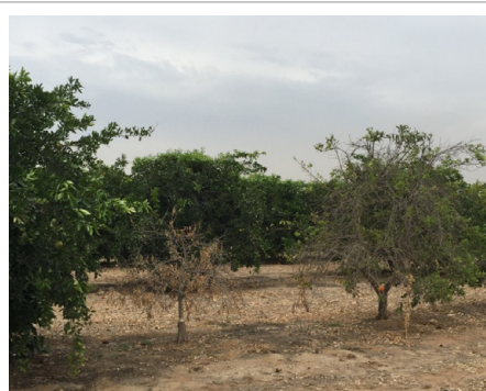
Figure 1: Trees showing several symptoms in the field.

The cultures of this isolate (strain UCR3312) obtained from Tulare County was similar to those obtained previously, it grew slowly on PDA producing orange red pigment that diffused into the agar and was noticeable at the underside of the agar medium. Observation of the conidia revealed morphological characteristics that matched previous