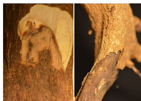
Figure 3: Canker and damages to the phloem (on the left) and Bark peeling (on the right). Trees showed bright, salmon pink pads from the dead bark that usually turn black with age.