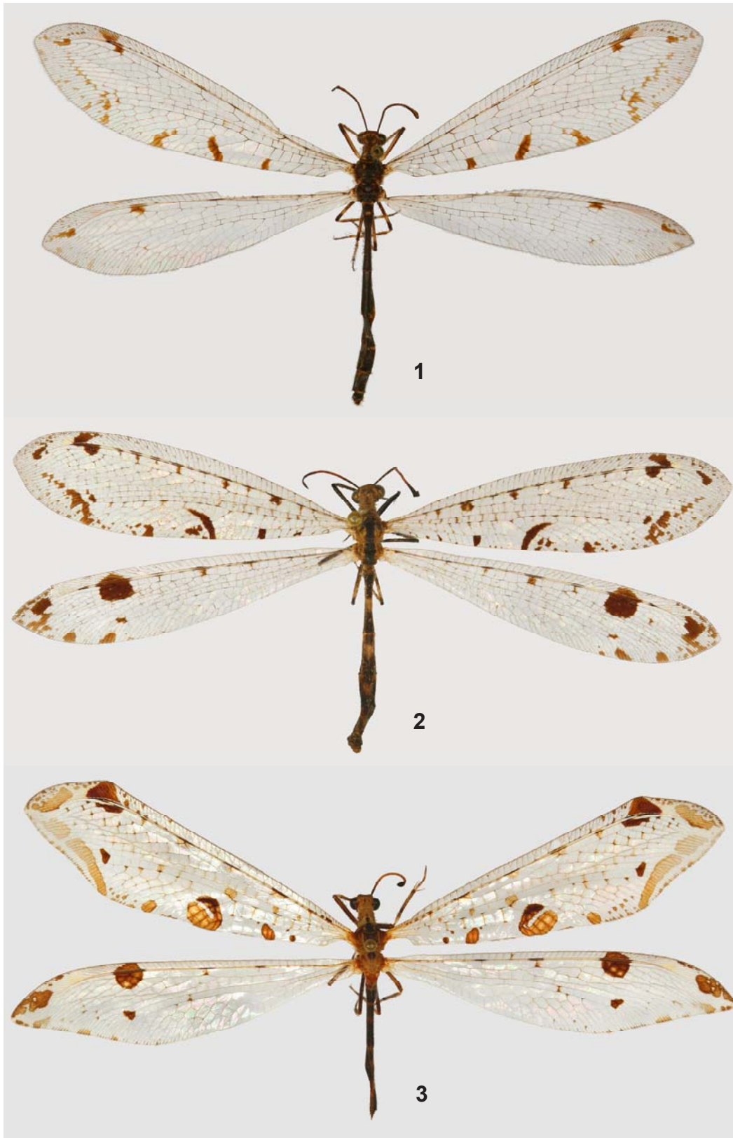
Figure 1-3. Adult Dendroleon females, full dorsal view. 1) D. speciosus . 2) D. obsoletus . 3) D. porteri , holotype.