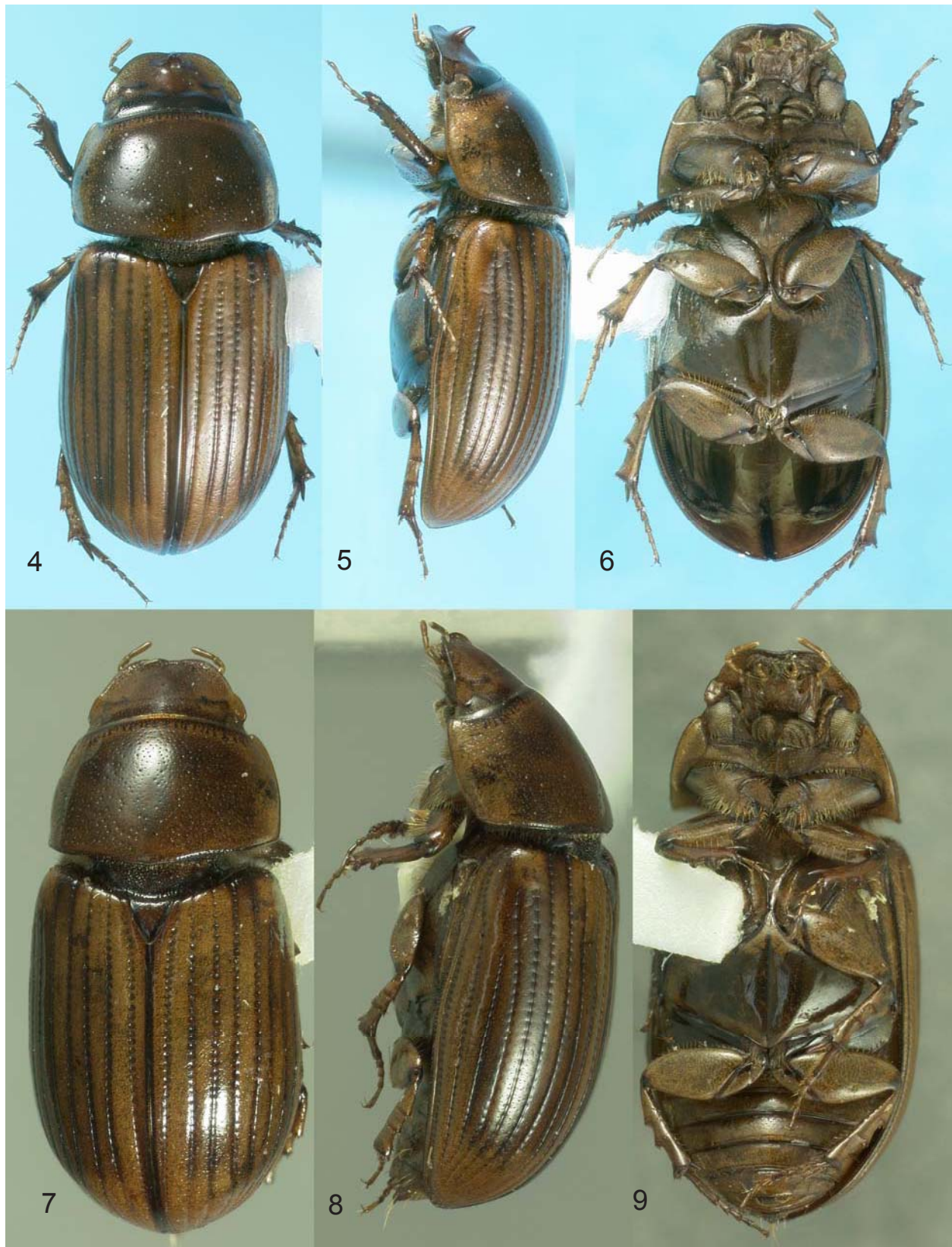
Figure 4-9. Gordonius rhinocerillus sp. nov. 4-6) Male habitus; dorsal, lateral and ventral. 7-9) Female habitus; dorsal, lateral and ventral.