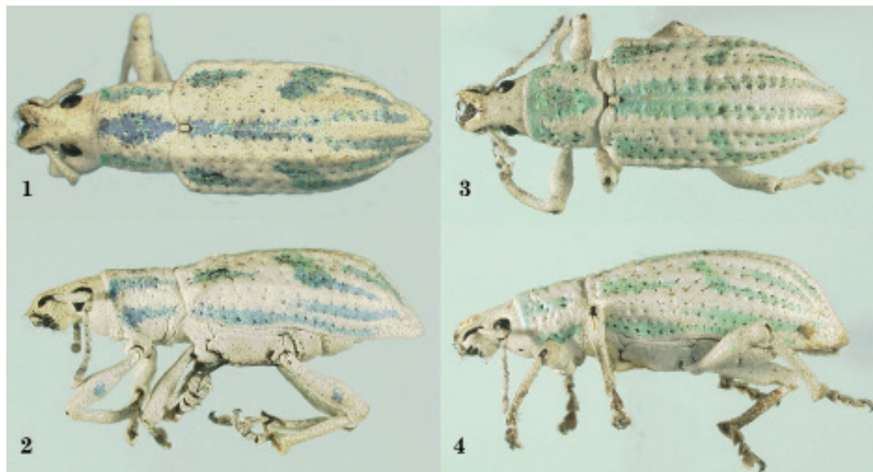
Figures 1–4. Habitus. 1) C. obliquatus –male dorsal. 2) C. obliquatus –male lateral. 3) C. obliquatus –female dorsal. 4) C. obliquatus –female lateral.