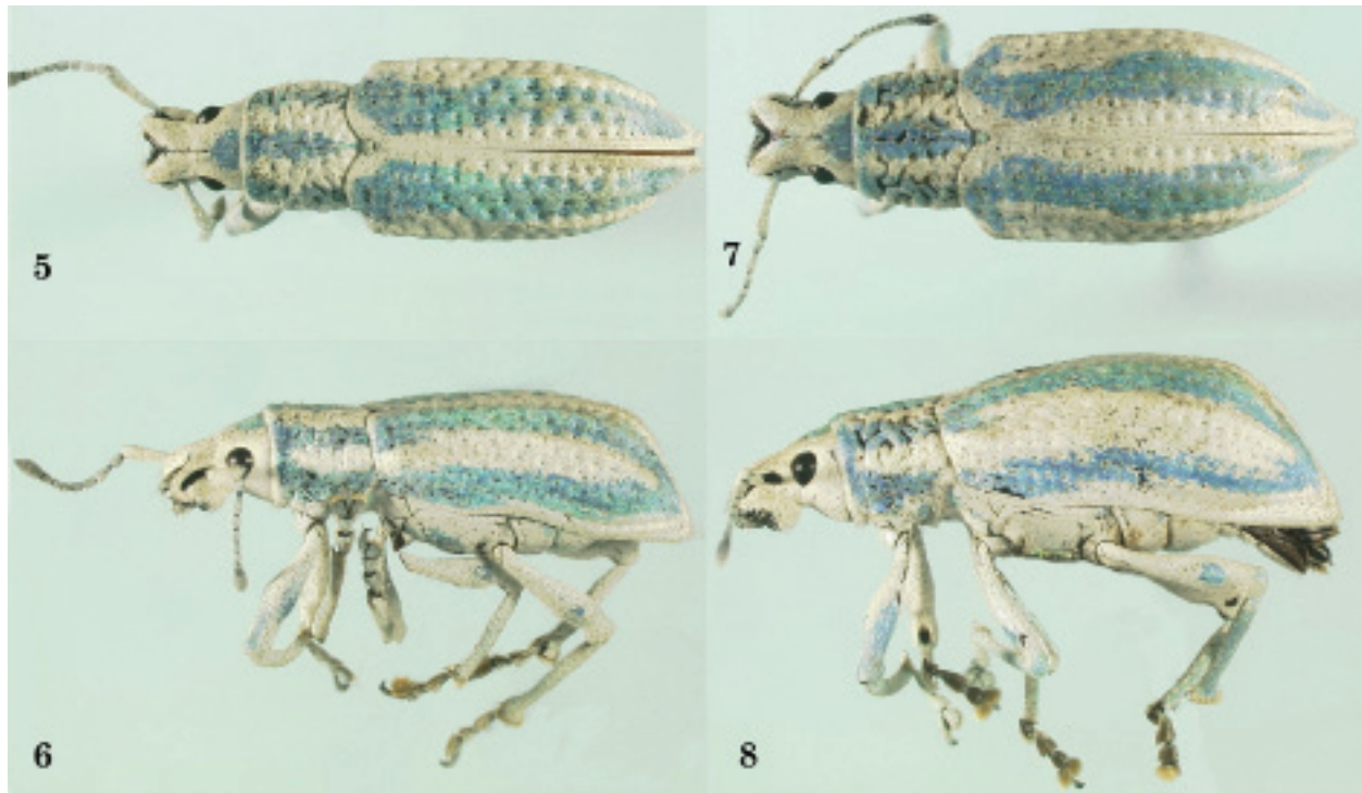
Figures 5–8. Habitus. 5) C. viridivittatus –male dorsal. 6) C. viridivittatus –male lateral. 7) C. viridivittatus –female dorsal. 8) C. viridivittatus –female lateral.

convex apically; sternum II strongly, transversely convex; sternum V narrowly, weakly, longitudinally convex along midline. Genitalia: Sternum VIII with plate elongate, sclerotized arms narrow, apically subtruncate, narrowly membranous between arms for entire length of plate. Spermatheca C-shaped, cornu slightly turned upward, ramus directed dorsally. Length, pronotum and elytron: 11.50mm. Length, head and rostrum: 2.80mm. Total length: 14.30mm.