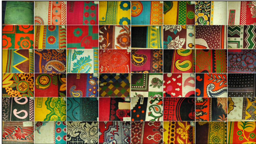
Composite of elements of the kanga design

Below are examples of diverse cultural contributions commonly incorporated in core elements of Kanga design.