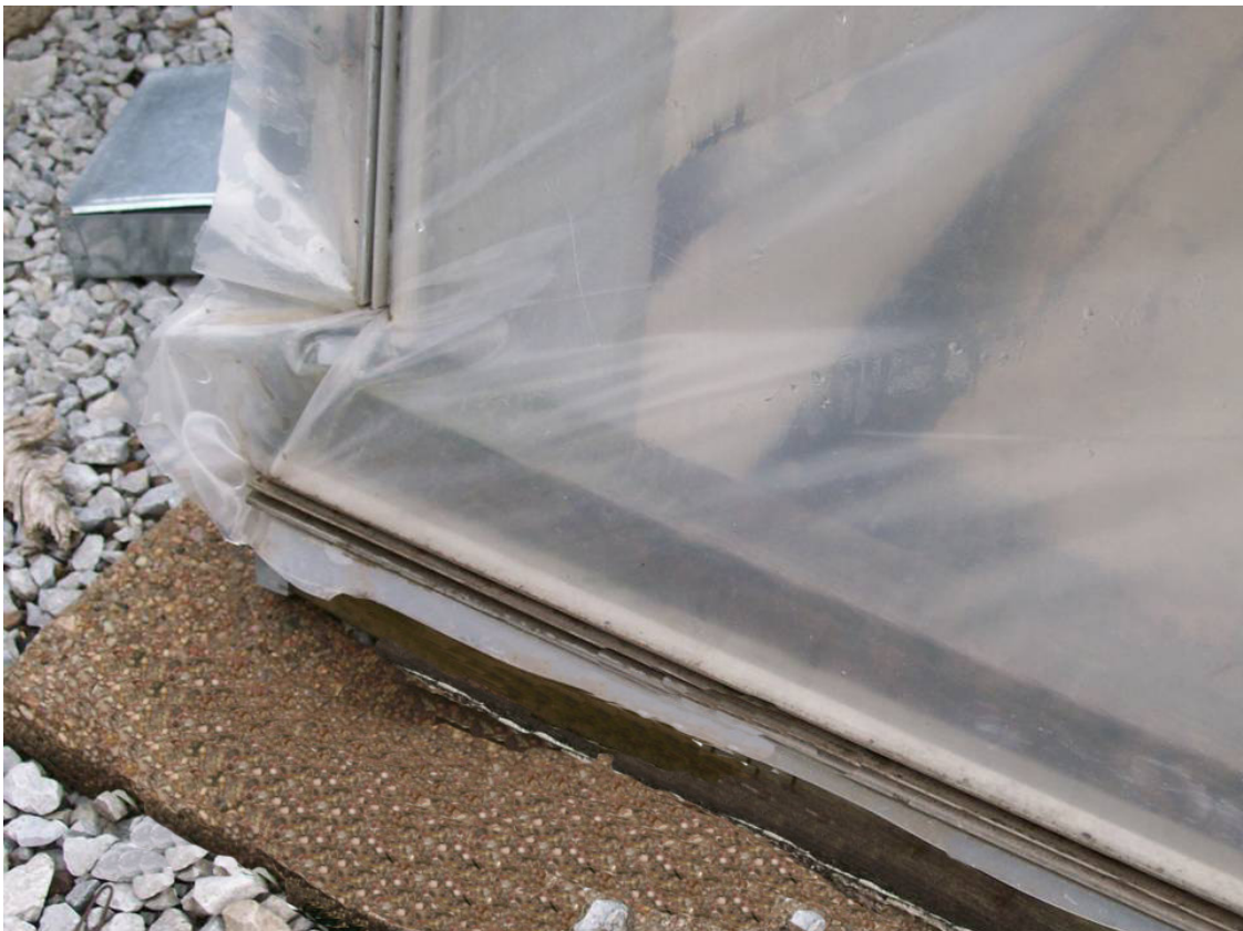
Figure 2. Close-up of solid cement footing into which structural posts are set. A 2-by-6-inch board is affixed to the posts, and polylock is attached to the board.