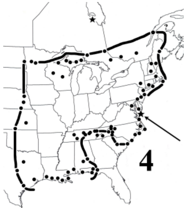
Figure 4. Distribution of Pseudopolydesmus serratus showing peripheral localities. Upper star, type locality of Polydesmus canadensis Newport, 1844, type-species of Pseudopolydesmus ; Lower Star, denoted by the arrow, approximate type locality of Polydesmus serratus Say, 1821, on the Eastern Shore of Virginia.