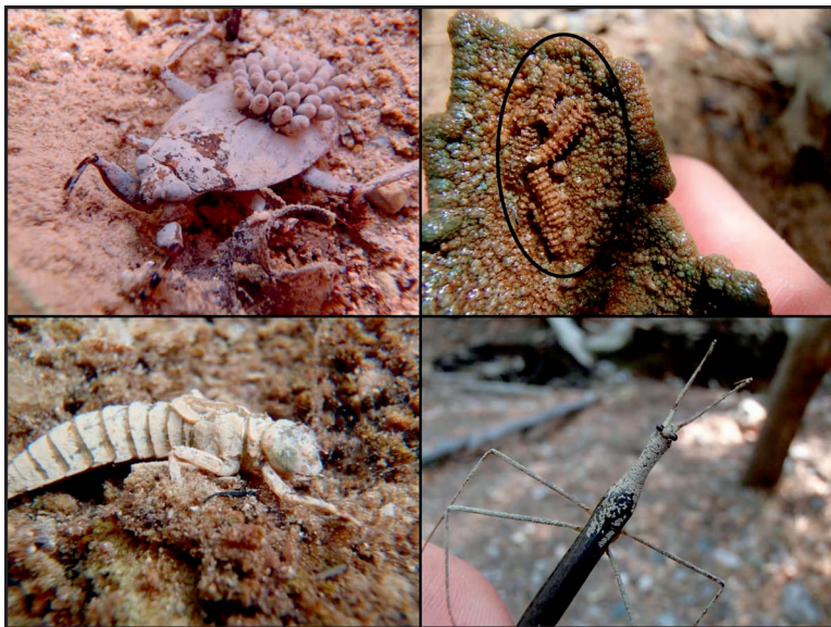
Fig. 1. Insects encrusted with \text{CaCO}_3 in Garden Canyon, Huachuca Mountains, Arizona. Clockwise from top left: Abedus herberti (Belostomatidae), Euparyphus sp. (Stratiomyidae), Oplonaeschna armata (Aeshnidae), and Ranatra quadridentata (Nepidae).

bedrock. As a result, perennial reaches of streams in the range are generally characterized by active travertine deposition (Bogan and Lytle 2011, Bogan et al. 2013a, Corman et al. 2015). We sampled aquatic insects 4 times in riffles and pools of Garden Canyon between 2009 and 2011 (methods outlined in Bogan et al. 2013a). Samples were preserved in 95% ethanol, which also preserved any \text{CaCO}_3 deposits present on insect exoskeletons. We identified insects to the lowest practical taxonomic level and noted whether any travertine encrustation was present on the exoskeleton. We assumed that all intact insects were alive at the time of collection. Designations of \text{CaCO}_3 encrustation on live insects were also supported by field observations of live organisms in the stream (Fig. 1).