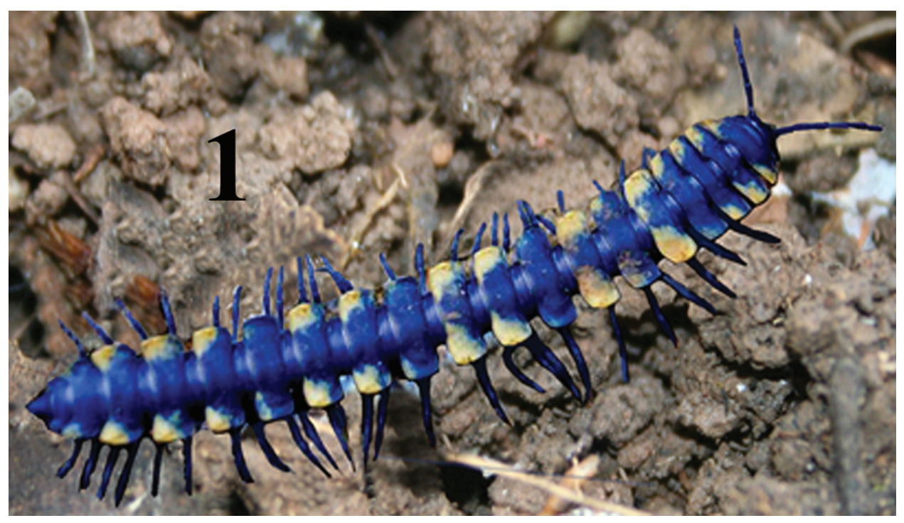
Figure 1. Tiphallus torreon, habitus photo showing in vivo dorsal coloration.

Color in life (Fig. 1). Dorsum and sides iridescent turquoise, lateral margins of collum and caudal paranotal corners on segments 2–18 with whitish areas varying from the tips and slight extensions along caudal margins on segments 6, 11, and 14, to large splotches covering caudal 2/3 to 3/4 of paranota on segments 5, 7, 9–10, 12–13, and 15–16. Epicranium medium turquoise, fading in interantennal and genal regions then darkening again on frons; labrum white. Pregonopodal sterna and prozonae dark to medium turquoise, fading on 7<sup>th</sup> sternum between 9<sup>th</sup> legs and only faintly blue thereafter. Legs