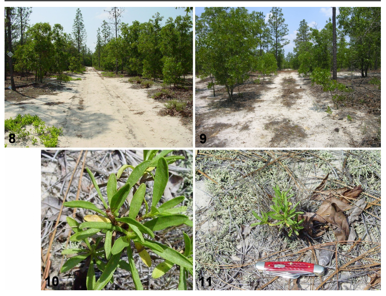
Figures 8-11. Ohoopee dune system. 8-9 ) Plesioclytus habitat in Ohoopee Natural Area. 10 ) Male Plesioclytus morrisi sitting on woody goldenrod. 11 ) Small woody goldenrod plant, the size typically utilized for perching by Plesioclytus morrisi new species.

Etymology . It is our great pleasure to name this species for the collector of the holotype, Roy F. Morris, II. It should be noted that this is the second new species to be described that was discovered by Roy in the Ohoopee dune system of Georgia, the first being Crossidius grahami Morris and Wappes, 2013.