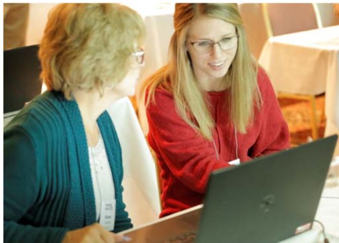
Participants work together on to build a farm in Quicken, a personal financial software, during a 2018 workshop

The future success of the conference depends on continued funding from grant agencies and sponsors. This year's conference was funded in part by a grant from the USDA Risk Management Agency. We were honored to have three premiere sponsors this year: Nebraska Corn Board,