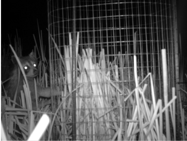
Figure 5. Photographic evidence of raccoon navigating through woven wire cylinder.