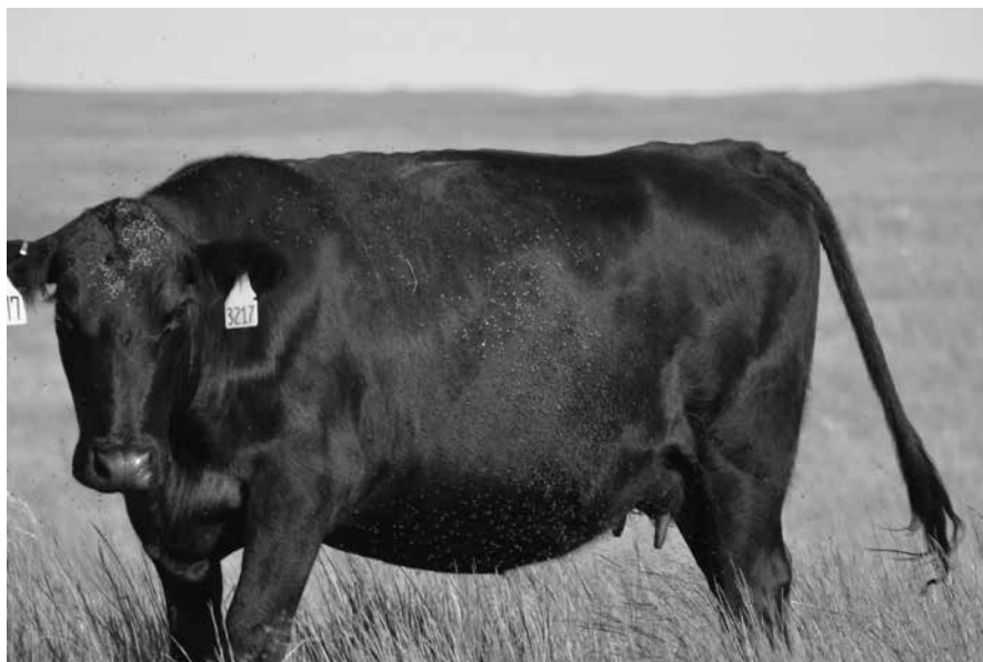
Figure 1. Cow with over 1,000 horn flies.

Horn flies are approximately 3/16" in length and usually found on backs, sides,