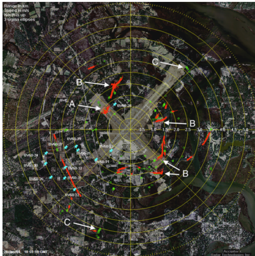
Figure 1 Radar display illustrating the locations (indicated by the ‘pushpins’ and text labels) of a black vulture carrying a global positioning system-platform transmitter terminal (GPS-PTT) tag. The series of square symbols (A, B) denote the tracks of a GPS-PTT vulture (A) and unidentified birds that appear to be vultures (B). The change in direction of the heading markers (line emanating from the Track symbols) in the examples indicate that the birds are circling at that point and are almost stationary over the ground. The series of open circles C indicates detections of birds that were too infrequent to generate tracks.