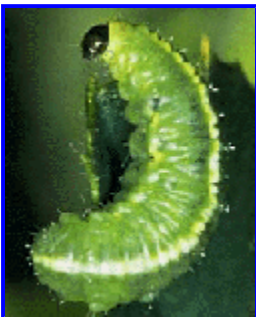
Figure 1. Alfalfa weevil larva.

Use integrated pest management (IPM) to reduce losses caused by the alfalfa weevil. Integrated pest management is a sustainable approach which combines biological, cultural, physical, and chemical tools in a way that minimizes economic, health, and environmental risks. Economic risks can be minimized by using approved alfalfa weevil scouting techniques and economic thresholds to make management decisions. Health risks can be minimized by avoiding pesticide use, but when pesticides are necessary, follow all safety directions provided on product labels. Minimize environmental risks by avoiding pesticide use when possible and by following all environmental or wildlife safety guidelines provided on the pesticide label when chemical use is necessary. This is of particular importance to alfalfa weevil management where weevil resistant alfalfa varieties are available and early cutting is often preferable to pesticide application.