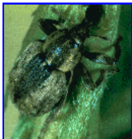
Figure 2. Alfalfa weevil adult.

The first indications of weevil injury are small holes eaten in leaves at the growing tip during April and May. This injury becomes more apparent as weevil larvae grow. Severely damaged fields have a white or gray appearance because of the drying of skeletonized upper leaves and buds. Damage is most severe to the first crop or cutting of the season and/or to the regrowth of the second crop. Larvae generally damage the first crop, while adult weevils damage regrowth by feeding on the developing crown buds, retarding growth and preventing fields from greening up after harvest. The severity of damage is influenced by alfalfa variety, stand health, weather, growing conditions, and the degree of parasitism of the weevil.