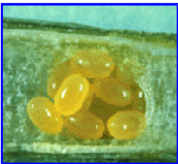
Figure 4. Alfalfa weevil eggs.

The pupae and adults are much hardier than larvae, and many survive after cutting until regrowth begins. Remove hay windrows or bales as soon as possible to reduce protection for susceptible weevil stages. Although highly favorable to regrowth, cool and moist conditions following cutting also favor weevil survival.