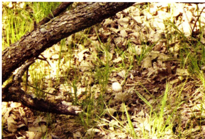
Whip-poor-will eggs (top), adult on nest (bottom), Ponca S. P., Dixon Co., 16 May 2009.