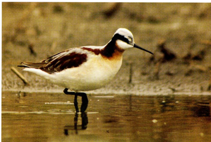
Female Wilson's Phalarope in breeding plumage, SE of Broken Bow, Custer Co., 26 April 2009.