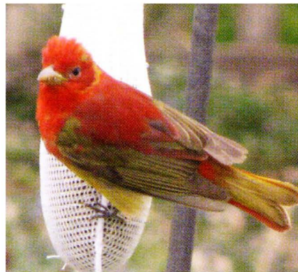
First year male Summer Tanager on niger seed feeder at Fairmont, Fillmore Co., 2 April 2009.