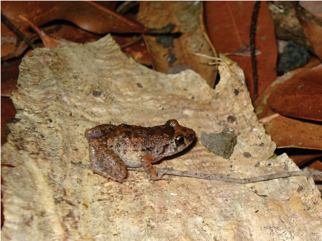
FIGURE 1. Adult female Eleutherodactylus planirostris in Hawai'i showing mottled color phase.

at one time considered subspecies of E. planirostris (Schwartz 1974, Díaz and Cádiz 2008).