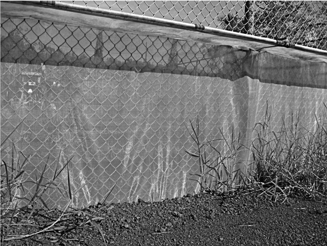
FIGURE 4. Photograph of a fine-mesh frog barrier attached to chain-link fence. The frog barrier is 1 m high with the bottom apron buried under gravel and an upper lip extending 25 cm out from the barrier at a 90° angle.

Castillo-Chavez 2001, Daszak et al. 2003). In addition, most major frog diseases infect tadpole stages and greenhouse frogs would be less affected (Daszak et al. 2003). One disease organism that has been implicated in frog population declines worldwide, the chytrid fungus, is already established in frog populations in Hawai'i (Beard and O'Neill 2005). Although there are no native frogs in Hawai'i and thus none at risk of infection, there is a chance that a frog infected with a disease could be transported to other states or countries. Thus, releasing a disease organism may affect frog populations elsewhere and could restrict trade.