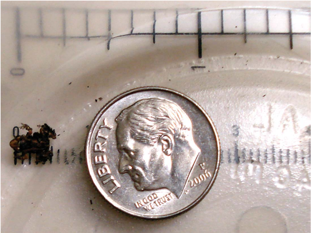
FIGURE 2. A recently hatched juvenile Eleutherodactylus planirostris from Florida (Sarasota County) showing size and striped color phase.

reddish brown (Ashton and Ashton 1988, Bartlett and Bartlett 2006). There is a dark S-shaped line from top of tympanum to arm insertion (Wright and Wright 1949).