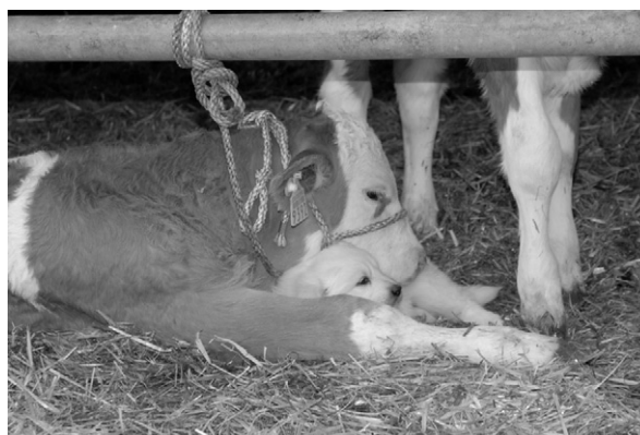
Fig. 2. Demonstration of the strong bond being developed by a livestock protection pup and a calf it will later protect from wildlife-related risks in USA and Europe.

We introduced pups to cows and calves in confinement to encourage interaction between them while monitoring