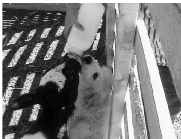
Fig. 1. Physical contact and bonding between calf and livestock protection pup used to protect cattle from wildlife-related risks in USA and Europe.

At 6–7 months of age, we initiated an acclimation process to familiarize pups with pastures they would eventually occupy. Pups were kept with their calves within pastures daily and returned to their smaller confines by