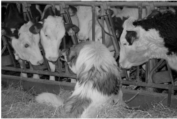
Fig. 3. Bonding behavior demonstrated by an adult livestock protection dog used to protect cattle from wildlife-related risks in USA and Europe (Photograph: Jean-Marc Landry).

for aggressive behavior. As the concept of bonding LPDs to cattle was relatively new in Switzerland, we started our first litter of pups ( n=4 ) in a flock of sheep and later transitioned them to cattle at 3–6 months of age. The pups quickly sought to interact with the calves, which demonstrated varied reactions. As adult cattle became accustomed to the presence of LPDs, they greeted LPDs or freely grazed without being disturbed by them and would be found resting and sleeping together. Once released into pastures with LPD-naïve adult cattle, LPDs would greet cattle in a submissive fashion, often licking around the muzzles of cattle (Fig. 3). We noted one situation where a LPD stayed within a few meters of a cow giving birth. The LPD did not interfere and appeared relaxed, as did the cow. Once the calf was born and got to its feet, the LPD greeted and licked it and still the cow showed no aggressive behavior toward the LPD.