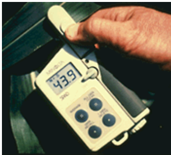
Figure 2. Close-up of chlorophyll meter.

The chlorophyll meter (see Figures 1 and 2 ) has several advantages over other tissue testing methods. A reading that indicates adequate nitrogen (or critical value) is not affected by luxury consumption; a plant will only produce as much chlorophyll as it needs regardless of how much N is in the plant. It is not necessary to send samples to a laboratory for analysis, saving time and money. Producers can sample as often as they choose, and can easily repeat the procedure if they question the results. Using a chlorophyll meter to monitor leaf greenness throughout the growing season can signal the approach of a potential N deficiency early enough to correct it without reducing yields.