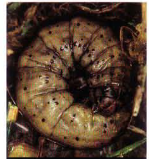
7. Black Cutworm