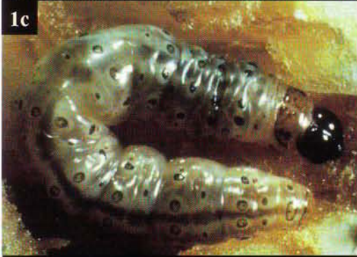
1. European Corn Borer