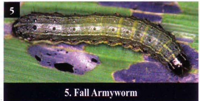
5. Fall Armyworm