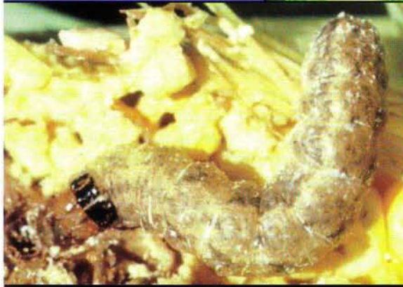
2. Western Bean Cutworm