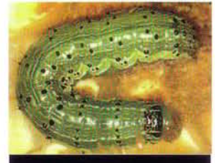
3. Corn Earworm