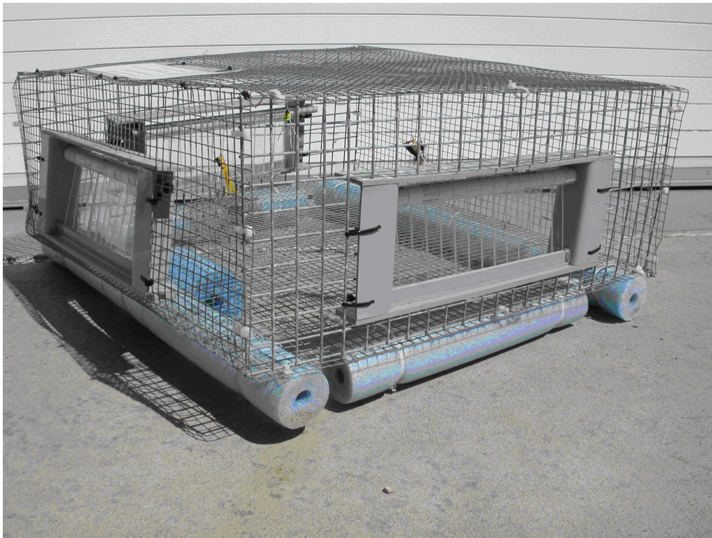
Fig. 1. A multiple capture trap modified to float.

were always placed in locations where bullfrogs had been previously viewed or heard. Adult bullfrogs were sexed by comparing the diameter of the tympanum to the diameter of the eye on each individual (George 1938; Bury and Whelan 1984). All captured bullfrogs were removed from the ponds and euthanized, and any non-target captures were released at the trapping site.