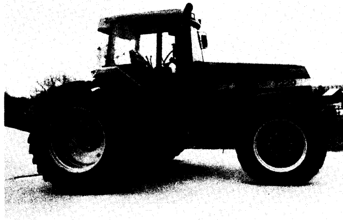
CASE IH 7220 DIESEL