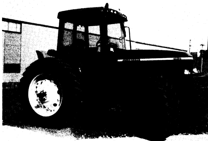
JOHN DEERE 7410 POWRQUAD DIESEL