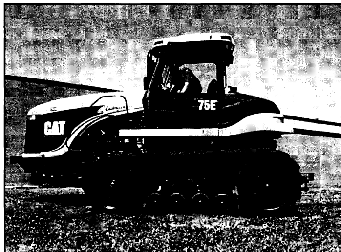
CATERPILLAR CHALLENGER 75E DIESEL