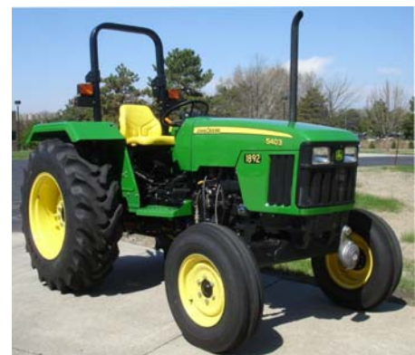
John Deere 5403 Diesel